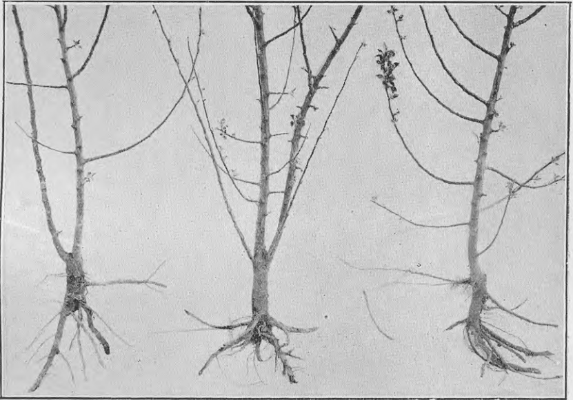
FIG. 1. TWO-YEAR-OLD NORTHERN SPY STOCKS GROWN FROM ROOT CUTTINGS.