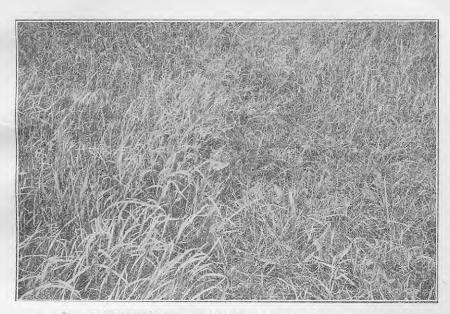
RECOVERY OF FALSE PERENNIAL COMPARED WITH TRUE ITALIAN.

True Italian line on left; false perennial (Southland Type 5) on right. The false perennial does not recover so well as Italian after cutting, and in view of its low persistency is inferior to Italian for temporary pasture.