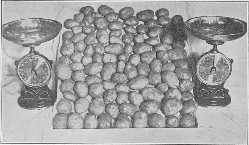
FIG. 4. BADLY GRADED LINE OF SEED.

sieves. On the other hand, probably every home has a set of moderately reliable scales, and taking tuber-weights is both accurate and convenient, and falls into line with the custom of referring to the size of tubers in terms of ounces.