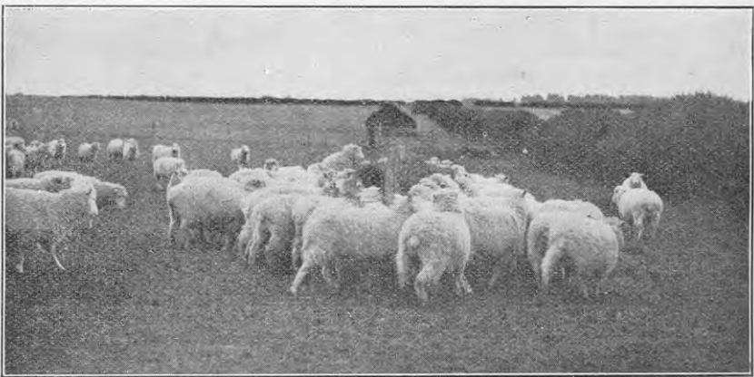
FIG. 3. EWES SHOWING KEENNESS FOR GOOD, SWEET, GREEN ENSILAGE.