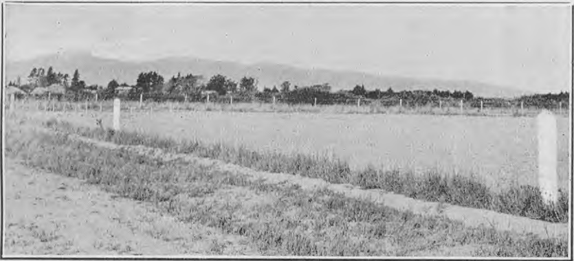
FIG. 15. SWING FENCE, WITH POSTS 6 IN. BY 6 IN. IN CROSS-SECTION, 1 CHAIN APART, AND 2 IN. BY 1 IN. WOODEN DROPPERS EVERY 6 FT.