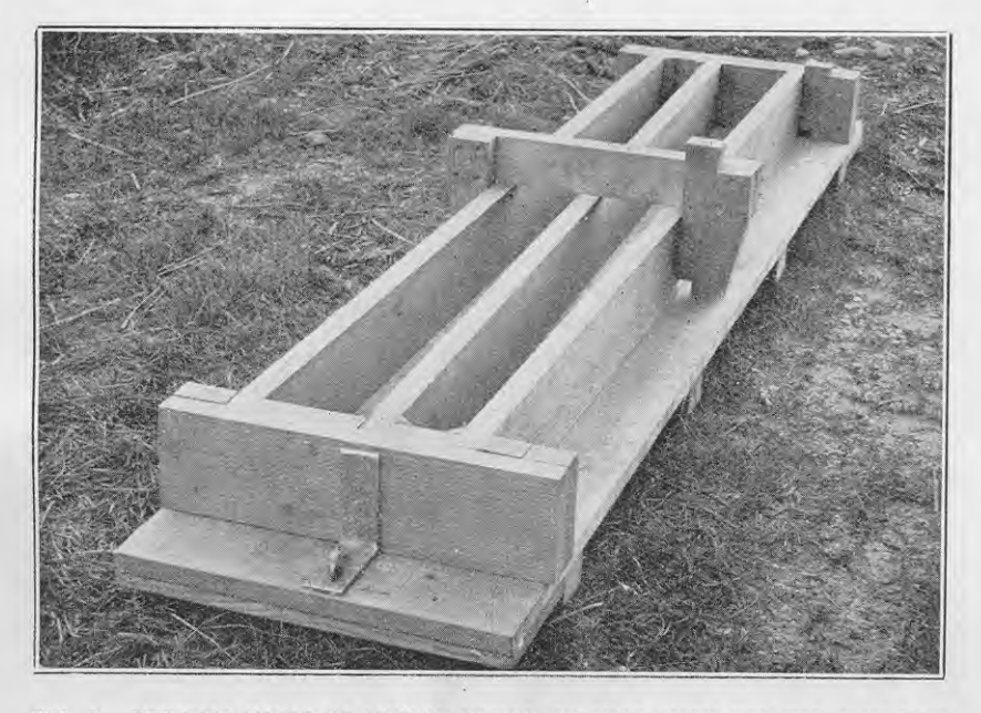
FIG. 5. TWO-POST MOULD OF SIMILAR DESIGN TO THAT GIVEN FOR THE FOUR-POST MOULD (FIG. 4).