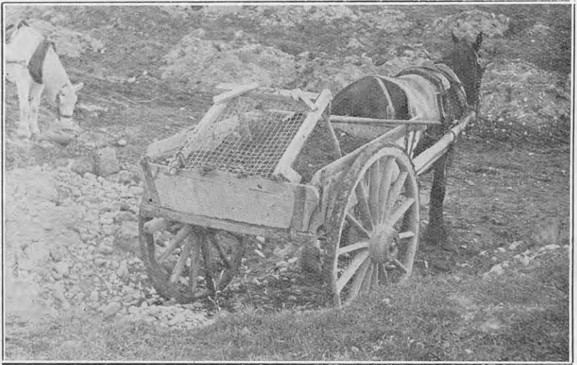
FIG. 2. METHOD OF SCREENING SHINGLE AT PIT.

Suggested dimensions for a screen such as shown are given in Fig. 3.