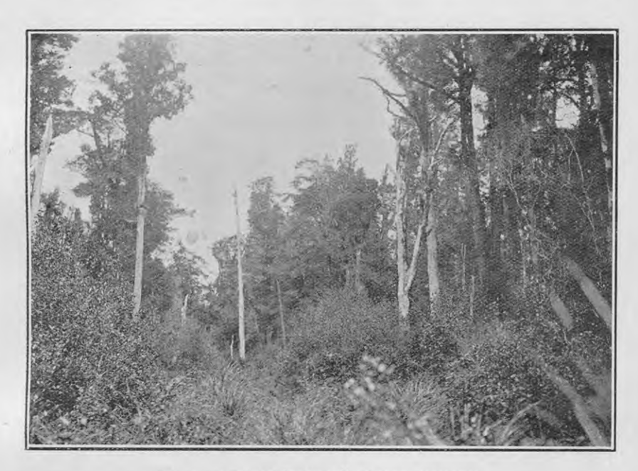
FIG. 3. TYPICAL "BIRCH" FOREST, MAMAKU. Samples R 946, 1126, and 1156 are representative of this soil.