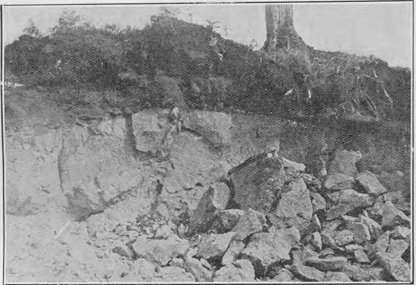
FIG. 1. SHOWING DEPOSIT OF PUMICE ON TOP OF RHYOLITE ROCK AT QUARRY NEAR MAMAKU.