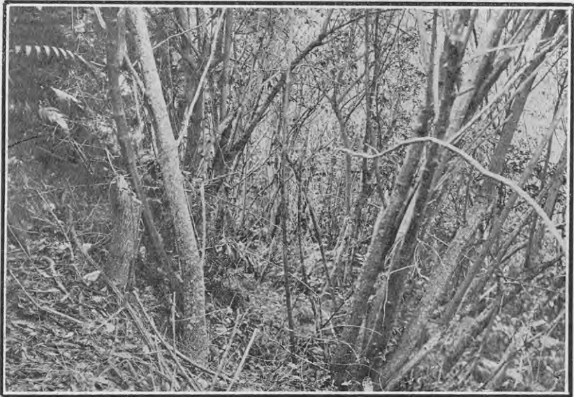
FIG. 14. TUTU IN THE FINAL STAGE OF THE FIRST SECONDARY-FOREST PHASE.

On the floor of this association the following plants were well established: Mahoe, fivefinger, karamu, kanono, hangehange, miro, weki, Blechnum discolor , Asplenium bulbiferum , Goniopteris pennigera .