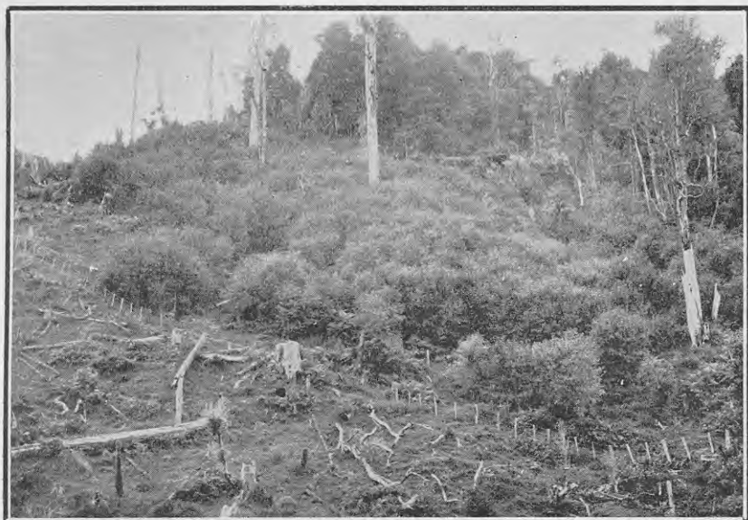
FIG. 6. WINEBERRY FORMING THE FIRST PHASE OF THE SECONDARY FOREST.