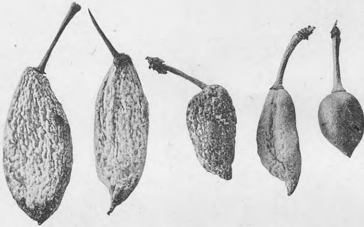
FIG. 5. BLADDER-PLUM (JAPANESE VARIETY). NATURAL SIZE. Showing gradual development from normal fruit (on right) to severely infected fruits.