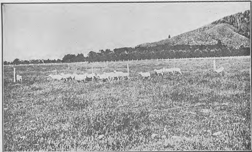
VIEW OF PADDOCK NO. 3, LOOKING NORTH INTO PADDOCK NO. 4

No. 2 (left hand), untreated Danthonia pilosa pasture, carrying 1\frac{1}{2} sheep to the acre; separated by netting from No. 3 (right hand), treated with unground native limestone rubble and 5 cwt. finely ground phosphate rock per acre in August, 1915, carrying 5\frac{1}{2} sheep to the acre. Taken 19/12/18.