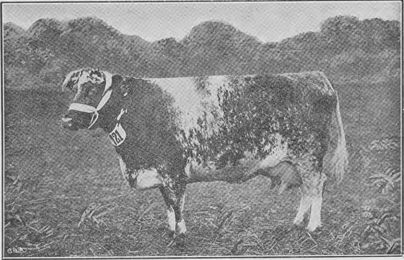
ENGLISH SHORTHORN COW, "SWEETHEART."