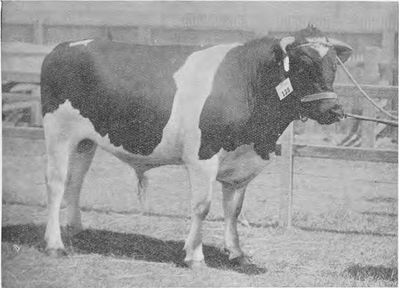
LONGBEACH VAN TROMP.