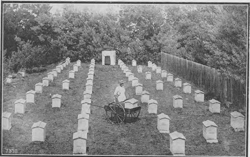
A WELL-ARRANGED APIARY.