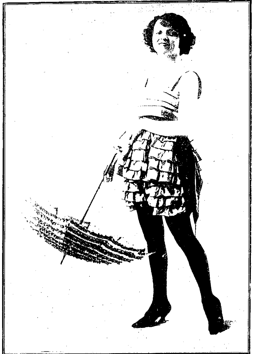
THE RUFFLED BATHING SUIT, WHICH PROMISES TO BECOME WIDELY POPULAR WITH FREQUENTERS OF THE BEACHES.—This pretty bathing costume is made of a flowered material and the ruffles are edged with black satin to match the large black sash that hangs down on the left side.