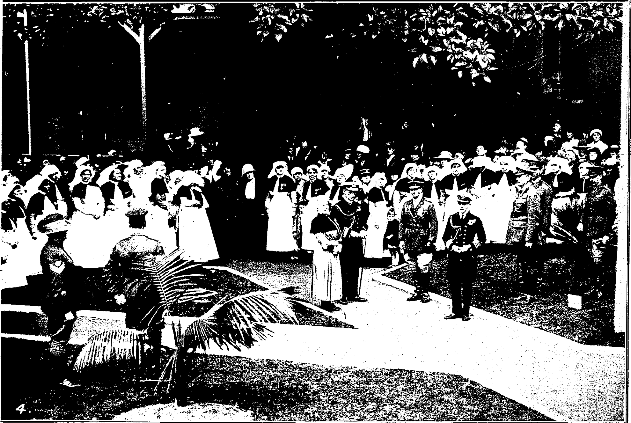
THE PRINCE CAME ASHORE FROM THE RENOWN IN A NAVAL BARGE, PASSING THROUGH A LANE OF SMALL BOATS, AND LANDING AT FARM COVE, SYDNEY. THE PRINCE OF WALES, HIS EXCELLENCY THE GOVERNOR-GENERAL, AND SIR LIONEL HALSEY, PASSING ALONG WENTWORTH AVENUE, SYDNEY, DURING THE ARRIVAL OF THE PRINCE OF WALES TO ATTEND THE AUSTRALIAN JOCKEY CLUB'S WINTER FIXTURES AT RANDWICK. 4 AN INTERESTING GROUP TAKEN AT THE RANDWICK MILITARY HOSPITAL DURING THE PRINCE OF WALES' VISIT. AND WAS ACCORDED A HIGHLY ENTHUSIASTIC WELCOME FROM THE NURSES AND DIGGERS.