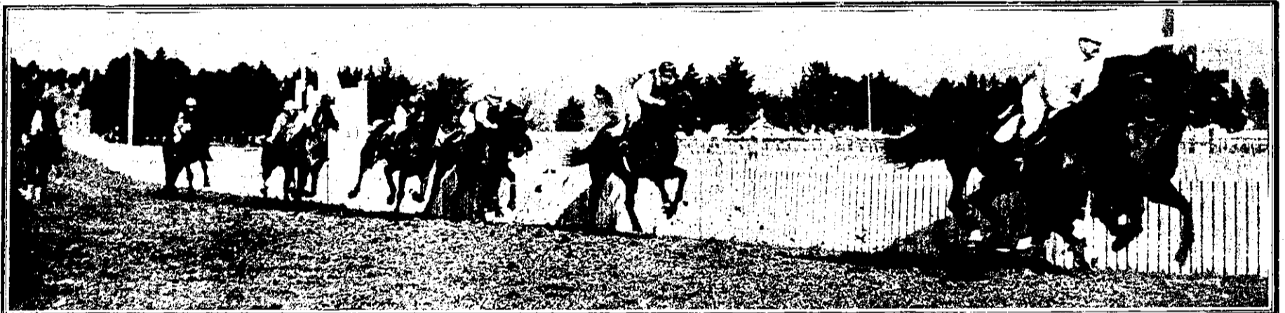
THE FIELD GOING OUT OF THE STRAIGHT IN THE LADIES' BRACELET HANDICAP (1/2 MILES)—PERSIAN KING (next rails), PARAWANUI (in centre) and LOCH DHU (on outside) racing in the lead, followed by POWDER KING, TATIMI, ALL OVER, ARMY SERVICE, WATERFORM, EUROPA and OHITI in the order named.