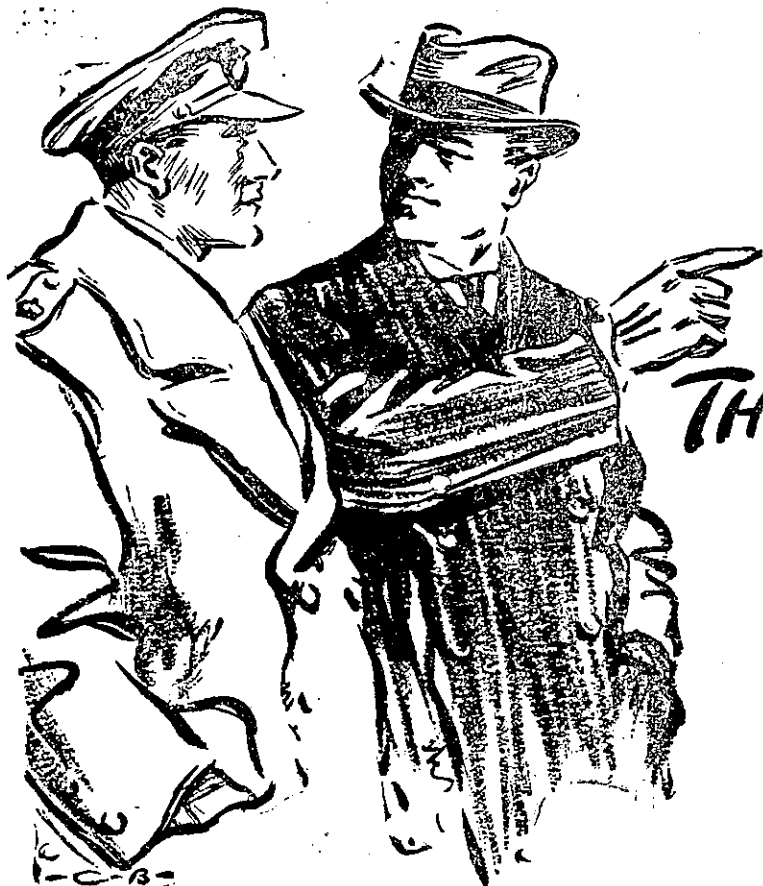
C. A. VANDERVELL & Co., LTD. Electrical Engineers ACTON, LONDON, ENGLAND

Published Monthly. Price, Sixpence. Of all Newsagents and Booksellers.