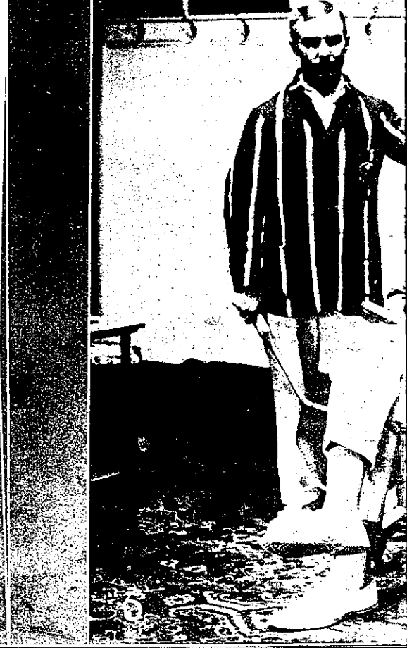
1. THE START OF THE FIRST ANNUAL CROSS-COUNTRY RUN SINCE THE OUTBREAK OF WAR BETWEEN TEAMS REPRESENTING OXFORD AND CAMBRIDGE. The run took place at Roehampton. 2. THE OPENING OF THE LONDON CHAMPIONSHIPS AT THE LOGAN CLUB, LOGAN-PLACE, EARL'S COURT ROAD, SHOWING THE PLAYERS WITH THE LADY UMPIRE (OXFORD), ON RIGHT, THE FIRST MAN HOME IN THE ANNUAL CROSS-COUNTRY RUN BETWEEN OXFORD AND CAMBRIDGE AT ROEHAMPTON. HE IS SHOWN BEING CONGRATULATED AFTER HIS WIN BY A CAMBRIDGE MAN. 3. THE FIRST MAN HOME IN THE ANNUAL CROSS-COUNTRY RUN BETWEEN OXFORD AND CAMBRIDGE AT ROEHAMPTON. HE IS SHOWN BEING CONGRATULATED AFTER HIS WIN BY A CAMBRIDGE MAN. 4. THE HIGH JUMP AT THE NATION'S SPORTS, IN WHICH RIVAL TEAMS FROM CAMBRIDGE UNIVERSITY AND THE AMATEUR ATHLETIC ASSOCIATION COMPETED. CAMBRIDGE WON BY 7 POINTS TO 4. 5. MESSRS. A. W. GOODFELLOW, TWO WELL-KNOWN PLAYERS WHO FIGURED PROMINENTLY AT THE REVIVAL OF FIRST-CLASS BADMINTON AT THE LONDON OPEN CHAMPIONSHIPS.