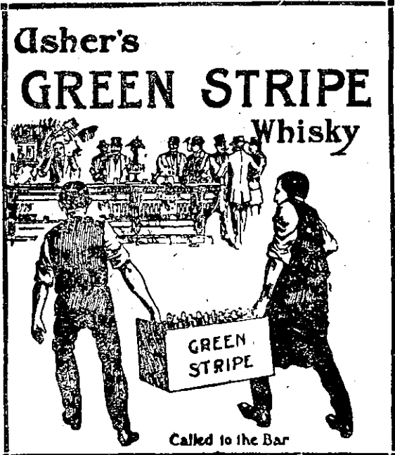
Called to the Bar

Sold in boxes, labelled price 10½d (36 pills), 1/1½ (56 pills) & 2/9 (168 pills).