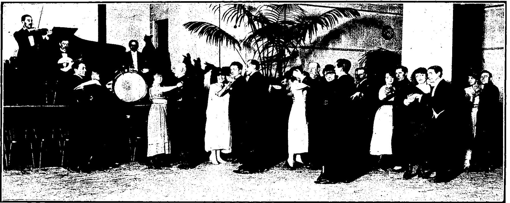
THE INAUGURATION OF A SERIES OF DANCES AT AUSTRALIA HOUSE, LONDON, PROVES EXTREMELY POPULAR. — FLASHLIGHT PHOTOGRAPH TAKEN AT AUSTRALIA HOUSE, THE HEADQUARTERS IN LONDON OF THE COMMONWEALTH GOVERNMENT, ON THE OCCASION OF THE FIRST OF THE SERIES OF DANCES.