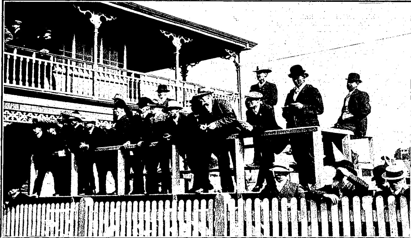
FAMILIAR FIGURES IN AUCKLAND RACING CIRCLES WATCHING THE START OF A RACE FROM THE TRAINERS' STAND AT THE TAKAPUNA RACING CLUB'S SUMMER MEETING.

it in the left top pocket; follow it with that in the centre, and finish with that on the right hand, but the last ball struck must be the first to go into the pocket, the second in its proper order, and the first last. This takes a lot of doing."