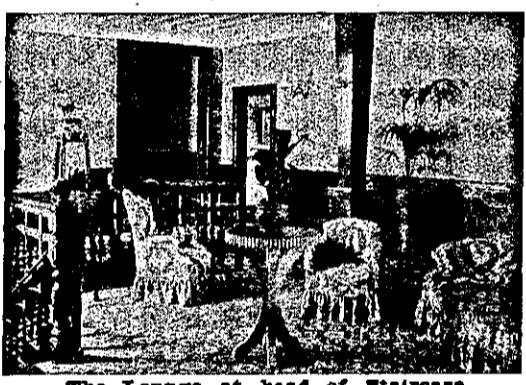
The Lounge at head of Staircase.

THE CAMPBELL & EHRENFRIED CO., Ltd., BREWERS, AUCKLAND.