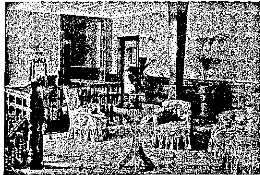
The Lounge at head of Staircase.

THE CAMPBELL & EHRENFRIED CO., Ltd., BREWERS, AUCKLAND.