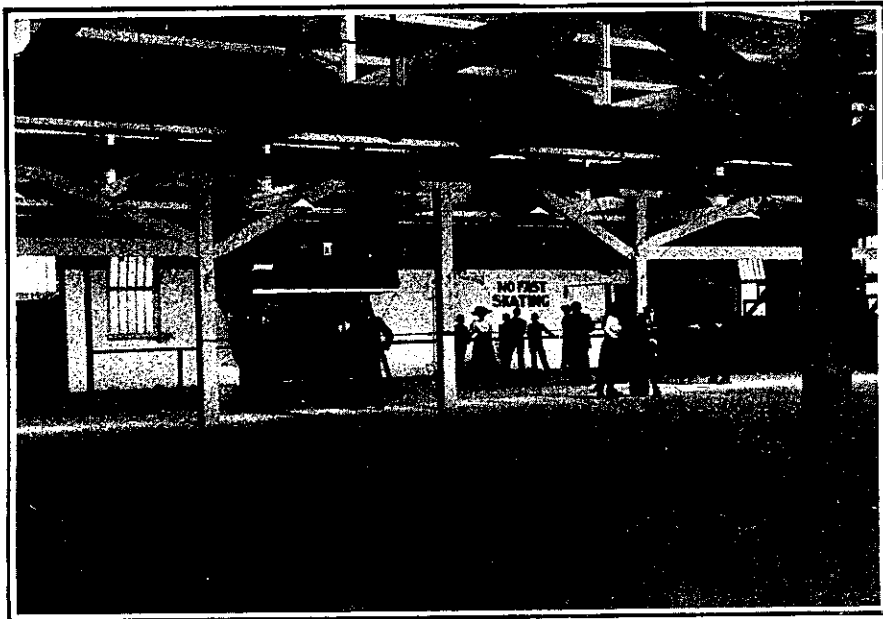
INTERIOR OF PRINCE'S SKATING RINK, AUCKLAND, SHOWING BAND STAND.