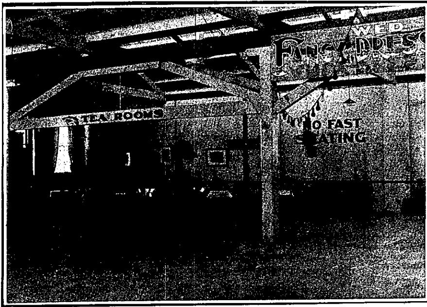
INTERIOR OF THE PRINCE'S RINK, AUCKLAND, SHOWING TEA ROOMS AT SIDE.