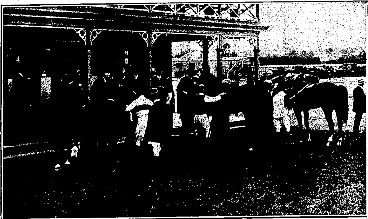
Weighting in after the Handicap Hurdle Race. From the left the horses are: DUNBORVE (the winner), TE ARAI (second), and CELTIC (third).