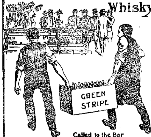
Called to the Bar