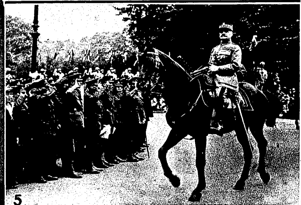
1. THE KING inspecting the Guard of Honour on arrival at the Guildhall to receive an address on the conclusion of peace. 2. GENERAL PERSHING, Commander-in-Chief of the American Expeditionary Forces, leading the American troops in the Victory March through London. 3. MARSHAL FOCH, the famous Allied Commander, arriving at the Guildhall, London, to receive the honorary freedom of the city and sword of honour during his memorable visit to England for the Empire's peace celebrations. 4. GENERAL BOURREMANS leading the Belgian contingent in the magnificent peace pageant through London. 5. MARSHAL FOCH being saluted by Guardsmen as he rode at the head of the gallant French troops who took part in the victory march through London. The presence of the great soldier in that stirring march, which his remarkable strategy and leadership had materially assisted in making an accomplished fact, stirred Londoners to a degree of enthusiasm that fully testified to their warm appreciation of his successful efforts in ensuring victory for the Allies.