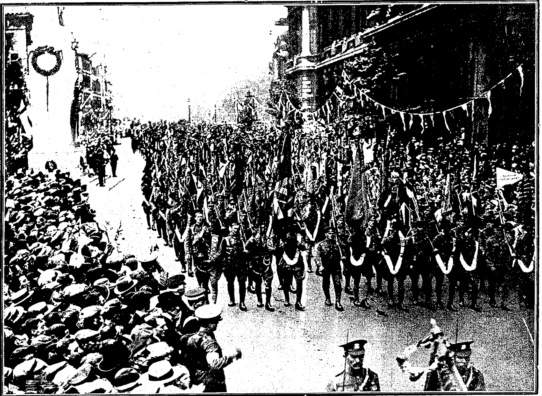
AN IMPRESSIVE SPECTACLE DURING THE BRILLIANT MARCH THROUGH LONDON OF THE ALLIED TROOPS ON JULY 19, THE DAY APPOINTED FOR THE EMPIRE PEACE CELEBRATIONS. INFANTRY WITH THEIR COLOURS PASSING THE MEMORIAL TO THE DEAD IN WHITEHALL. The most appealing incidents of the day were at the Cenotaph in Whitehall. This monument, a pillar of massive simplicity, crowned with a great laurel wreath, was inscribed to "The Glorious Dead." Four Guardsmen stood at the corners of the memorial with arms reversed and heads bowed. Emotion was almost unbearable when such victors as Sir Douglas Haig, Marshal Foch, General Pershing, and Admiral Beatty saluted the dead.