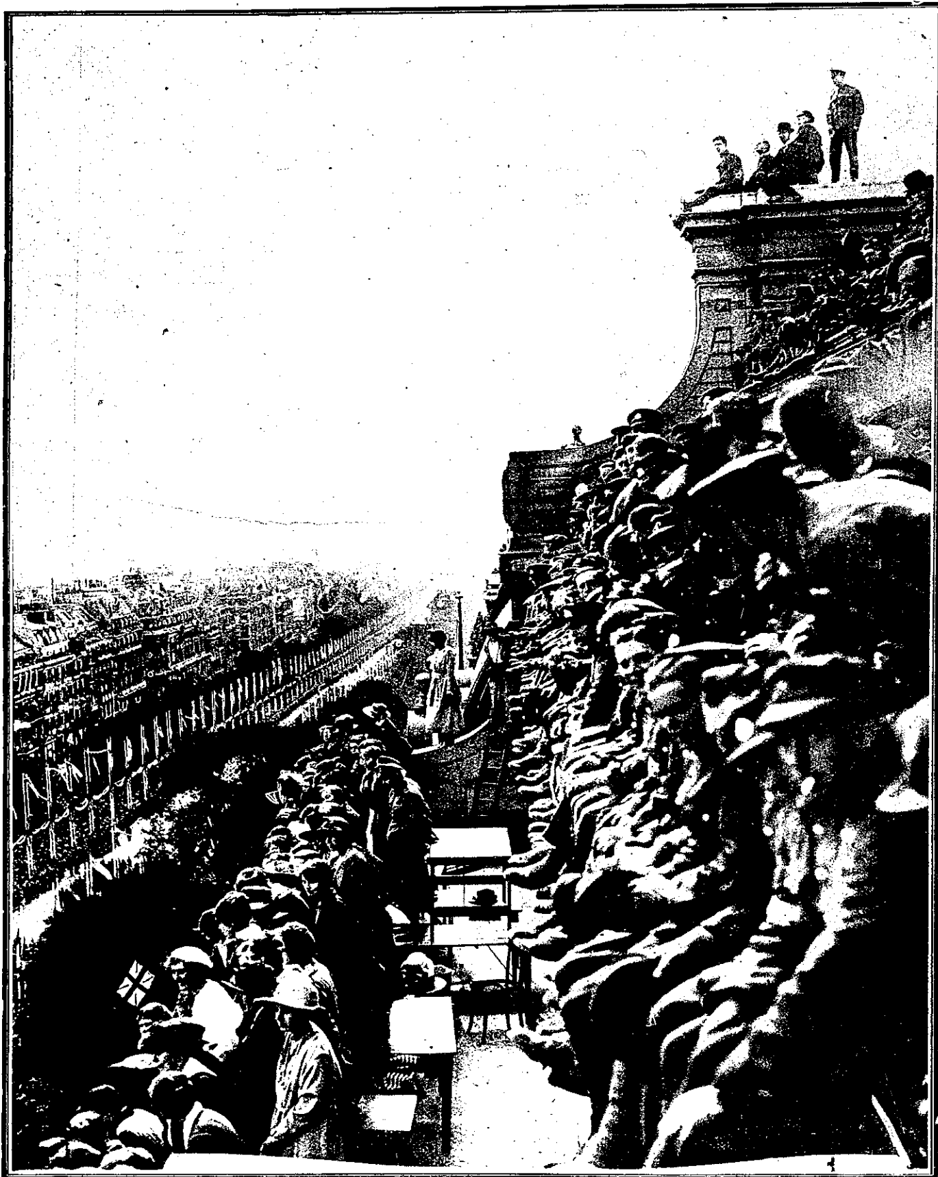
WATCHING THE MEMORABLE PEACE PROCESSION IN PARIS—BRITISH TOMMIES OCCUPY A SPECIAL POINT OF VANTAGE, FROM WHICH THEY SECURED AN ADMIRABLE VIEW OF THE SPECTACULAR PAGEANT THROUGH THE GAILY DECORATED STREETS.