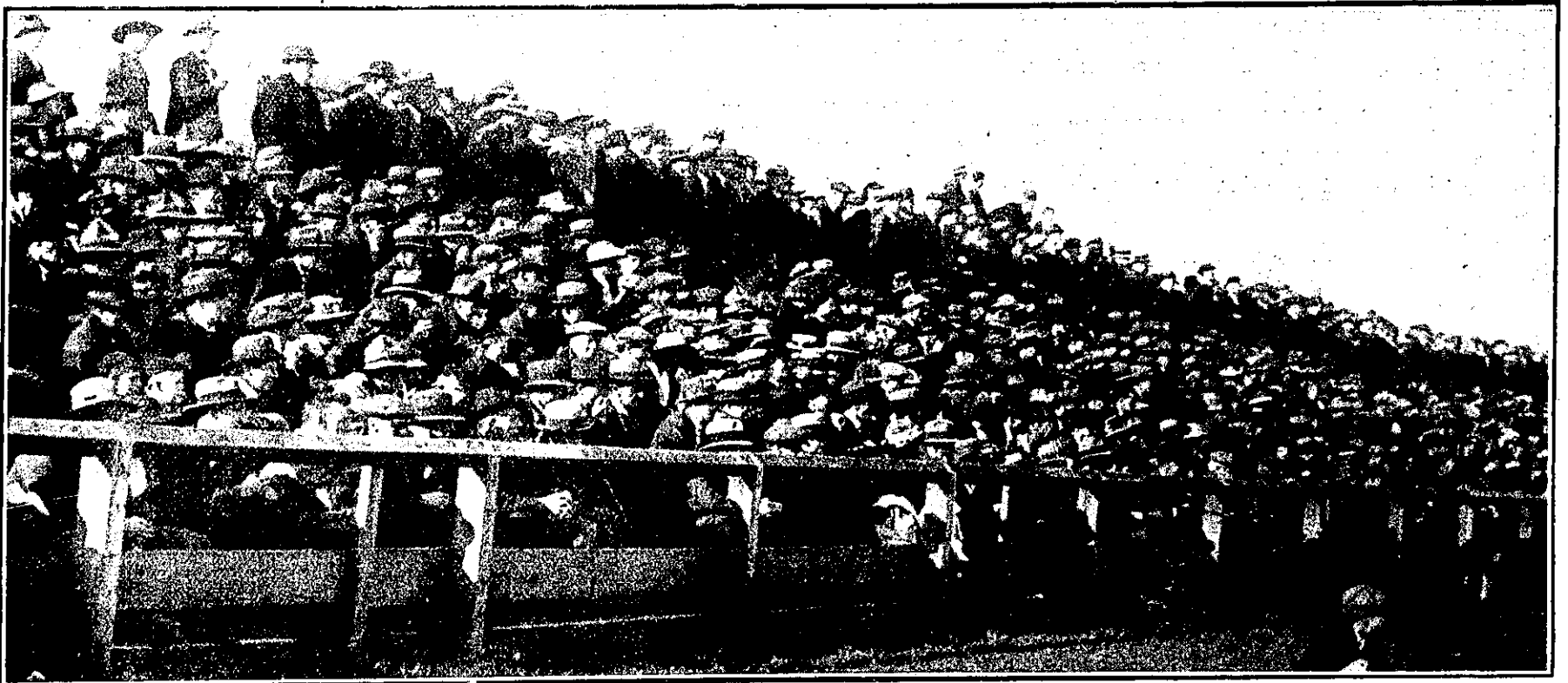
INTERESTED SPECTATORS AT THE NORTH V. SOUTH ISLAND RUGBY FOOTBALL MATCH ASSEMBLED AT THE NORTH END OF THE PARK.