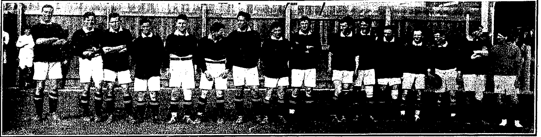
THE NORTH ISLAND RUGBY FOOTBALL REPRESENTATIVES, 1919, WHO DEFEATED THE SOUTH ISLAND BY 28 POINTS TO 11.