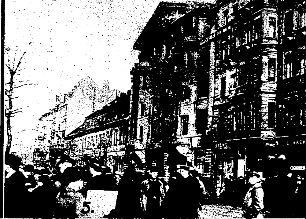
1. The police headquarters building in Berlin which was badly damaged by bombs, machine guns and artillery fire during the revolution. Eichborn, Chief of Police, who was thoroughly incited, was deposed by the Ebert Government, but refused to yield his authority. An attack was made on the police headquarters, which were cleared after some terrific fighting. 2. A crowd gathered in front of the Mosse Building (in which are situated the "Tageblatt" offices) in order to witness the surrender of the Spartacides, who had raised the white flag. The building is pitted with bullet marks. 3. The "Tageblatt" newspaper office, which suffered considerable damage during the riots. 4. Government troops with a machine gun outside the wrecked plant of the newspaper "Vorwaerts," awaiting an attack of Spartacides. Early in the new year the latter secured possession of the Vorwaerts Building, and made it the centre of their armed resistance. It was a position of great importance. In order to reduce it, the Government eventually securing possession. 5. A street scene in Berlin, showing some of the buildings which are extensively marked by machine gun fire during revolutionary fighting.