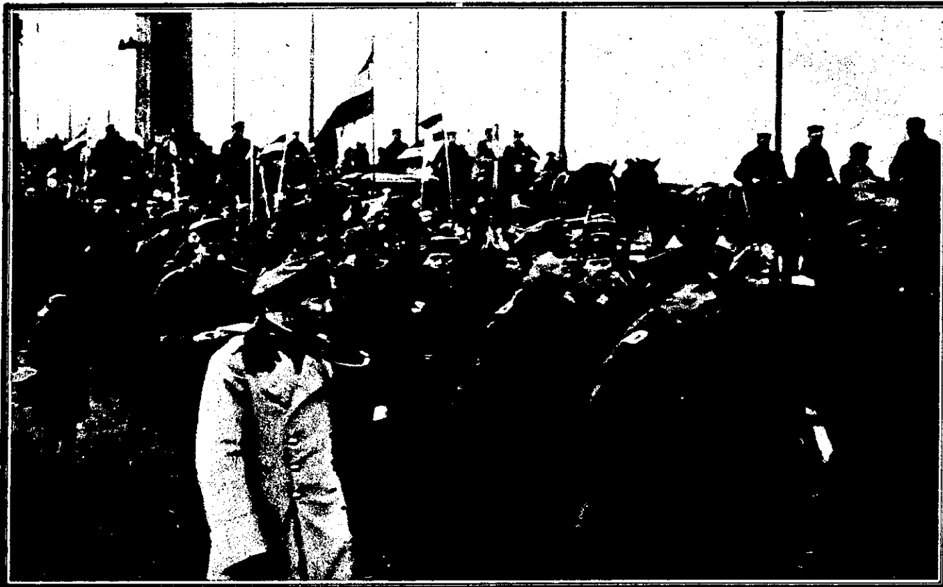
THE REMNANTS OF GERMANY'S ONCE POWERFUL ARMIES CROSS THE BRIDGE AT COLOGNE AFTER THEIR BITTER LESSON THAT MILITARISM HAS FAILED TO ACCOMPLISH ITS DIABOLICAL OBJECT. The Huns carried flags and still maintained a spirit of bravado though evidently fully conscious of the humiliation of their position.