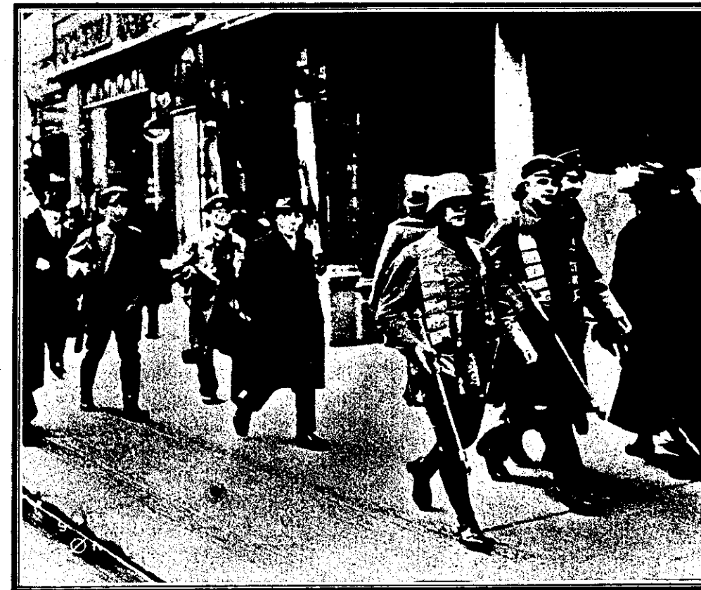
CIVIL WAR IN BERLIN--A STREET SCENE DURING THE FREQUENT CLASHES BETWEEN GOVERNMENT TROOPS AND THE SPARTACAN RIOTERS. Spartacans are seen with rifles, ammunition belts and hand grenades.