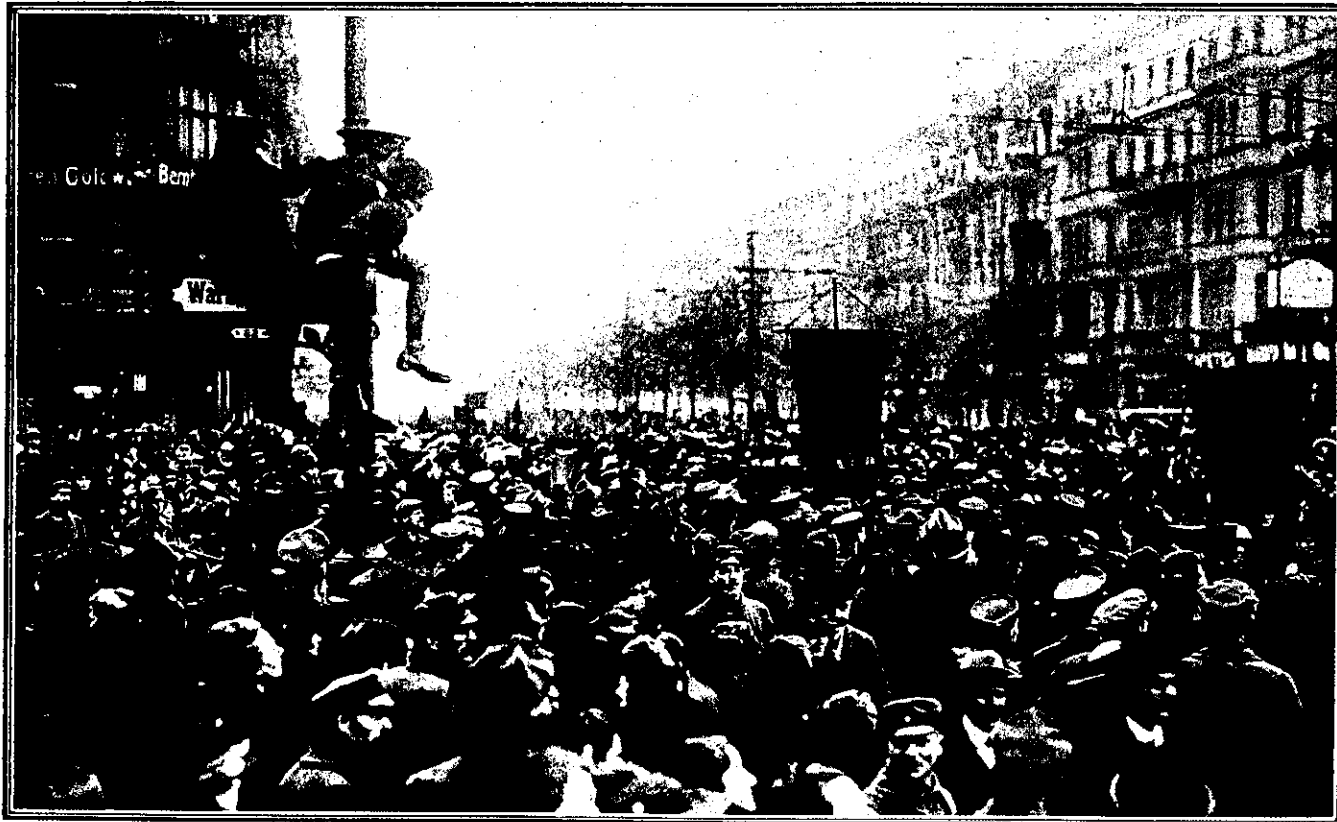
FOUR-MILE FUNERAL PROCESSION IN BERLIN.—The funerals of Liebknecht and thirty-two other Spartacists, who were killed during recent revolts in Berlin, passed off unexpectedly quietly, though the military were prepared for all eventualities. Wreaths were carried in the procession, which was more than four miles long.