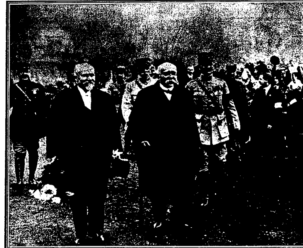
M. CLEMENCEAU (on right), Premier of France, and M. POINCARÉ (on left) Colmar. M. Clemenceau, who is popularly known as "The Tiger," was wounded to enter his car in the courtyard of the Ministry of War by an assailant, who take the Premier's life. He has since made a wonderful