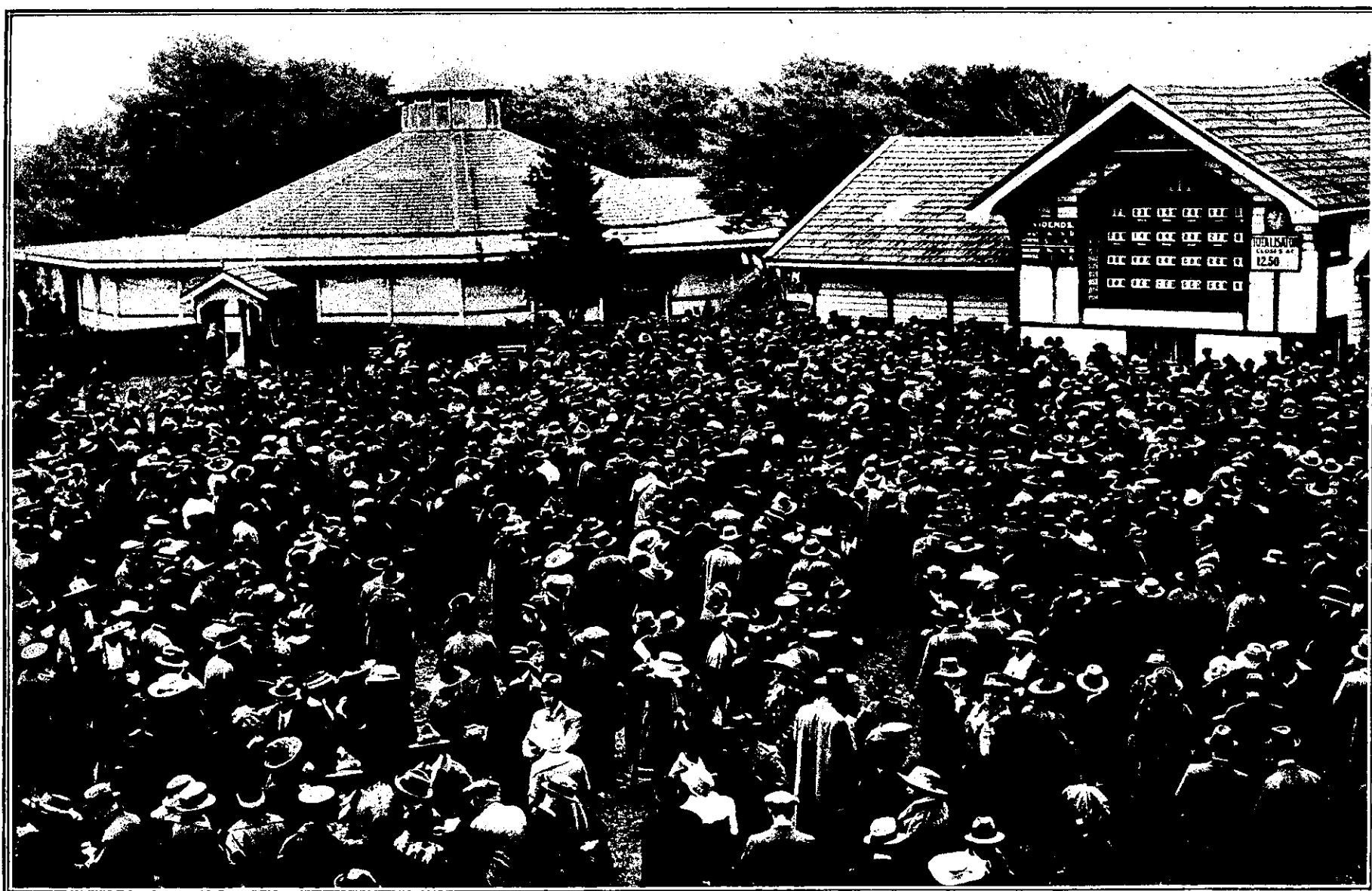
ENJOYING THE AFTERNOON'S SPORT AT TRENTHAM. RACEGOERS ASSEMBLED IN THE VICINITY OF THE TOTALISATOR ON THE CONCLUDING DAY OF THE WELLINGTON RACING CLUB'S SUCCESSFUL AUTUMN MEETING. The totalisator investments for the day amounted to £51,684 10s., making a total of £86,192 for the meeting.