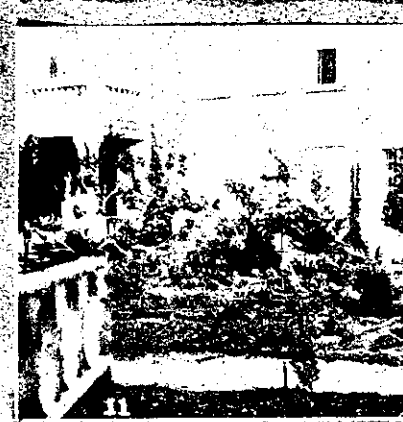
1. New Zealanders watching their shells bursting in the Turkish trenches. 2. Some of the boys enjoying a pleasant trip down the Nile on the riverboat. 3. A resident of Jaffa returning to the city after he had been expelled therefrom. 4. New Zealand soldiers with their horses just before they attacked Beersheba. 5. One of the New Zealanders' old camps on the beach. 6. Graves of Australian soldiers in the streets of Jaffa. 7. Turkish women in quest of water supplies. 8. View of the city of Jaffa, the citizens of which gave the New Zealanders a rousing welcome as the latter rode through the streets. 9. Some of the guns captured by the New Zealanders at Beersheba. 10. Maori soldiers enjoying a much-appreciated trip on the Nile. 11. German Consul's residence at Jaffa, which was made the headquarters of the New Zealand officers.