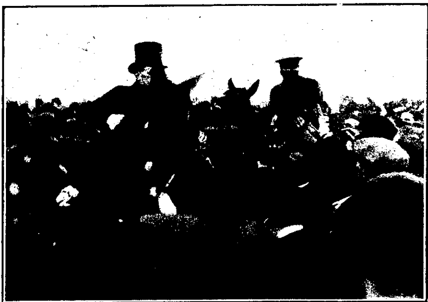
Silver Badge Men "mob" the King.—A truly wonderful scene, illustrating the affection in which the King is held was witnessed on the occasion of his review of the Silver Badge men. The Prince of Wales, who was vociferously cheered, is seen shaking hands with allcomers.