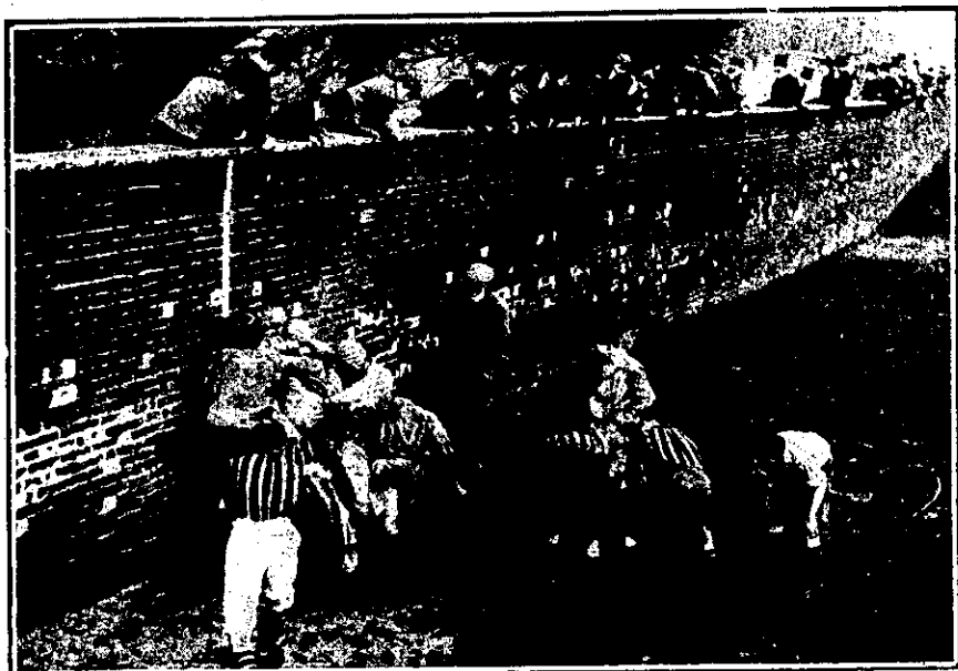
The famous "Wall Game" at Eton. The annual match in progress between Collegers and Oppindans, showing an exciting moment in the game.