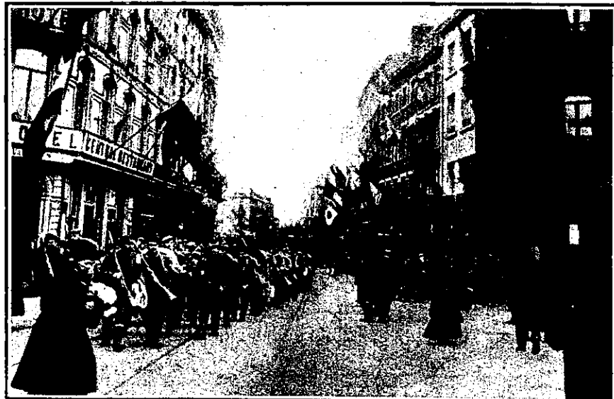
First photograph of the German evacuation of Belgium in accordance with the armistice terms. German troops are seen marching through the streets of Liege as they leave the town. The decorations consist of Allied flags.