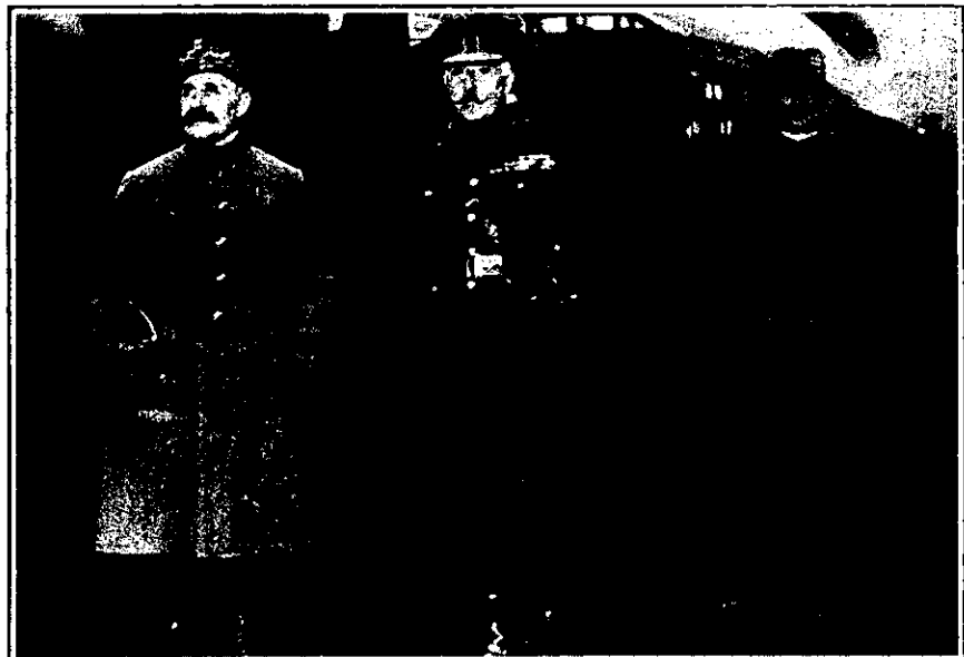
MARSHAL FOCH, Commander-in-Chief of the Allied Forces (on left) and the DUKE OF CONNAUGHT (in centre) photographed at Charing Cross, London, upon the arrival of the famous general in England.