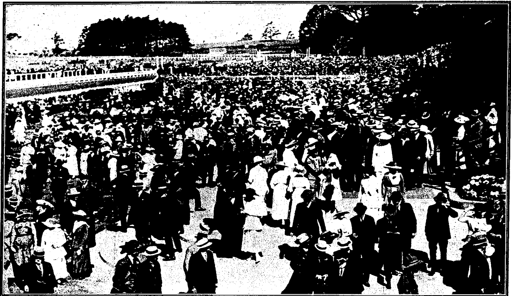
AN ANIMATED SCENE ON THE LAWN AND TERRACES IN FRONT OF THE MAIN STAND AT ELLERSLIE ON AUCKLAND CUP DAY.