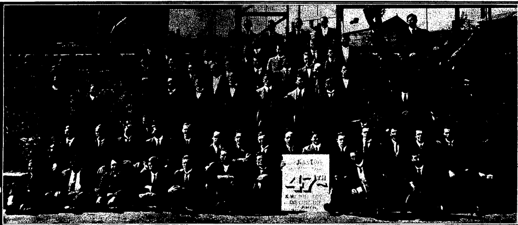
THE LATEST DRAFT OF RECRUITS FROM THE AUCKLAND CITY AREA TO LEAVE FOR TRENTHAM CAMP. SOME MEMBERS OF THE FORTY-SEVENTH REINFORCEMENTS PHOTOGRAPHED IN THE PARADE GROUND AT THE DRILL HALL, AUCKLAND, PRIOR TO THEIR DEPARTURE BY SPECIAL TRAIN FOR TRENTHAM ON THURSDAY AFTERNOON LAST.