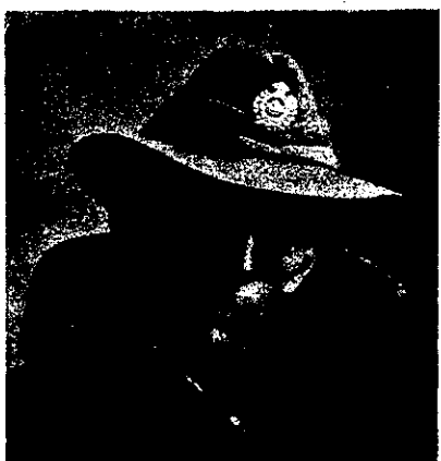
LANCE-CORP. WM. GEO. LEANING, of Auckland. Killed in action.