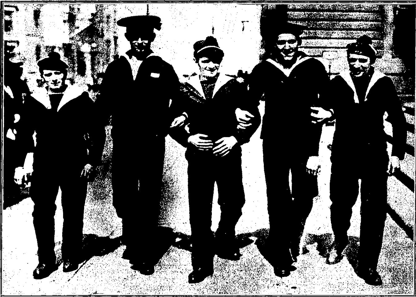
A CHARACTERISTIC WAR TIME STREET SCENE IN THE FASHIONABLE FIFTH AVENUE, NEW YORK. A happy party of French and American sailors constituted a feature of a recent Sunday parade of fashion and society in Fifth Avenue, New York.