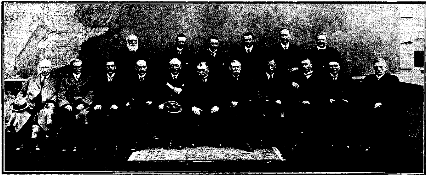
GROUP OF DELEGATES WHO ATTENDED THE ANNUAL NEW ZEALAND TROTting CONFERENCE IN WELLINGTON LAST WEEK.