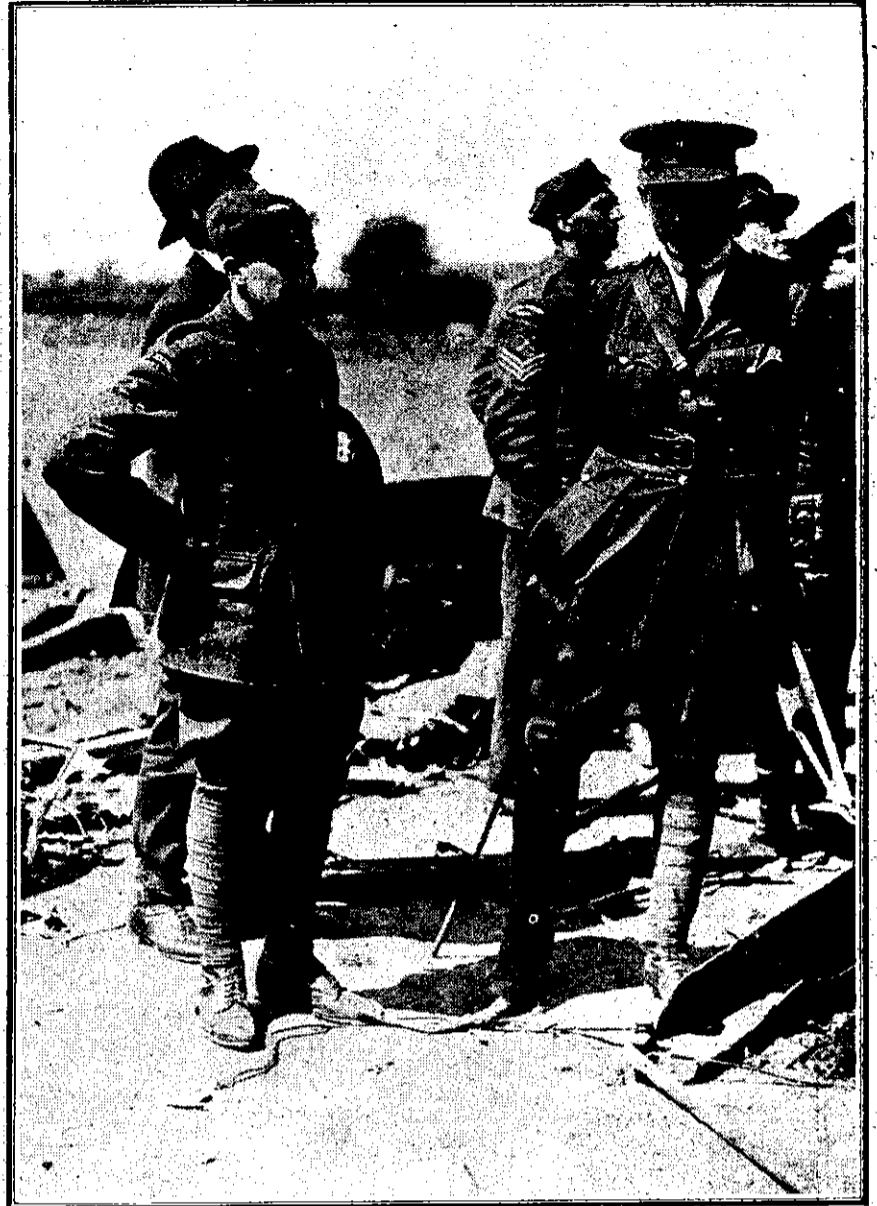
GROUP OF BRITISH AIRMEN who were instrumental in bringing down a German Gotha during an ambitious aerial night attack over England, which, however, was doomed to failure. The nearest figures in the group are the pilot and observer of one of the victorious British machines.