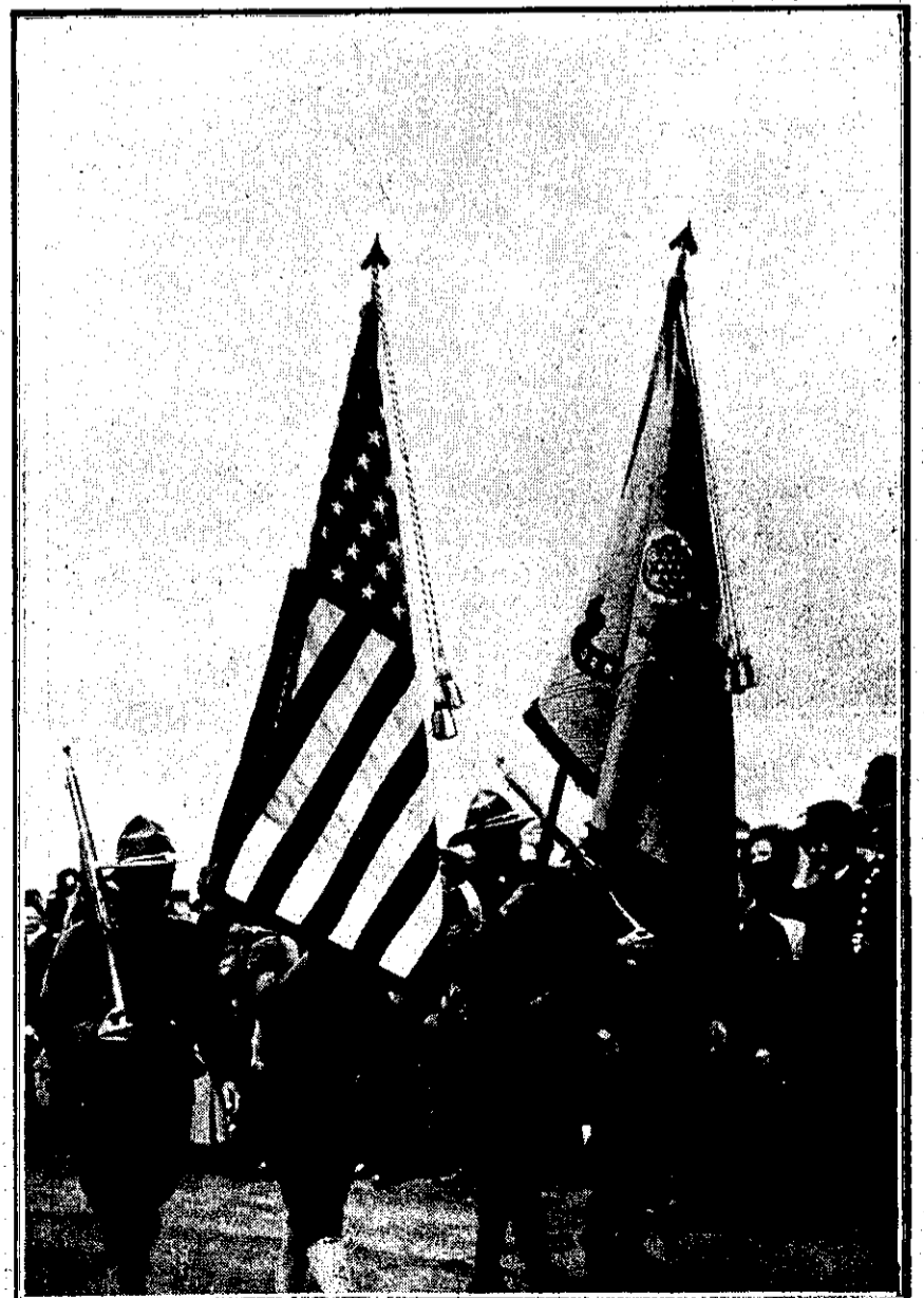
"OLD GLORY" IN LONDON STREETS. —A GREAT PUBLIC WELCOME TO THE SOLDIERS OF THE UNITED STATES. A regiment of American troops, consisting of three battalions of the New Army, recently created remarkable enthusiasm as a result of their march through London. The illustration shows the celebrated flags of the United States heading the procession. The Americans passed Buckingham Palace on their route, and as the Stars and Stripes went by the King gave a special salute.