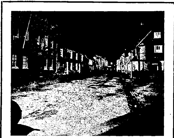
Motorists from the Old Country will recognise the scene as the Village of Amersham, Bucks. The building in the far distance, 375 yards from the car, is the old town hall, built by Sir William Drake in 1682. The width of the beam of light is 35 yards.

Is right in front for starting efficiency and light-giving capacity, and behind it stands the name of Vandervell. From the dynamo to the battery, the battery to switchboard, the switchboard to head, side, tail and interior lamps, it is a thoroughly sound system; a system, too, which is equally suitable for every style and type of car.