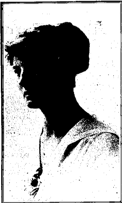
MISS WAYMOUTH, Captain of the Feilding Ladies' Golf Club.

The Feilding Golf Course of nine holes, portion of which is shown in the accompanying illustration, is prettily situated on the left bank of the Oroua, just a mile from the centre of the town. It is one of the handiest courses in the Dominion. The land being river deposit is very dry in winter. The greens are very fair, but it is the intention of the Club to have greens as fine as it is possible to make them.