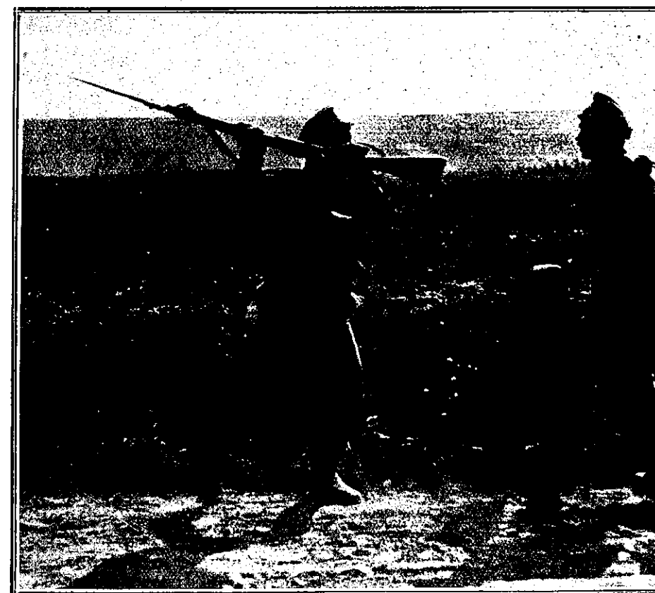
AN EXCITING INCIDENT DURING THE WHOLESALE DESERTION OF THE RUSSIAN ARMY. A Russian soldier of the old school meets two deserters and attacks them with his rifle. He was incensed at their unpatriotic conduct.