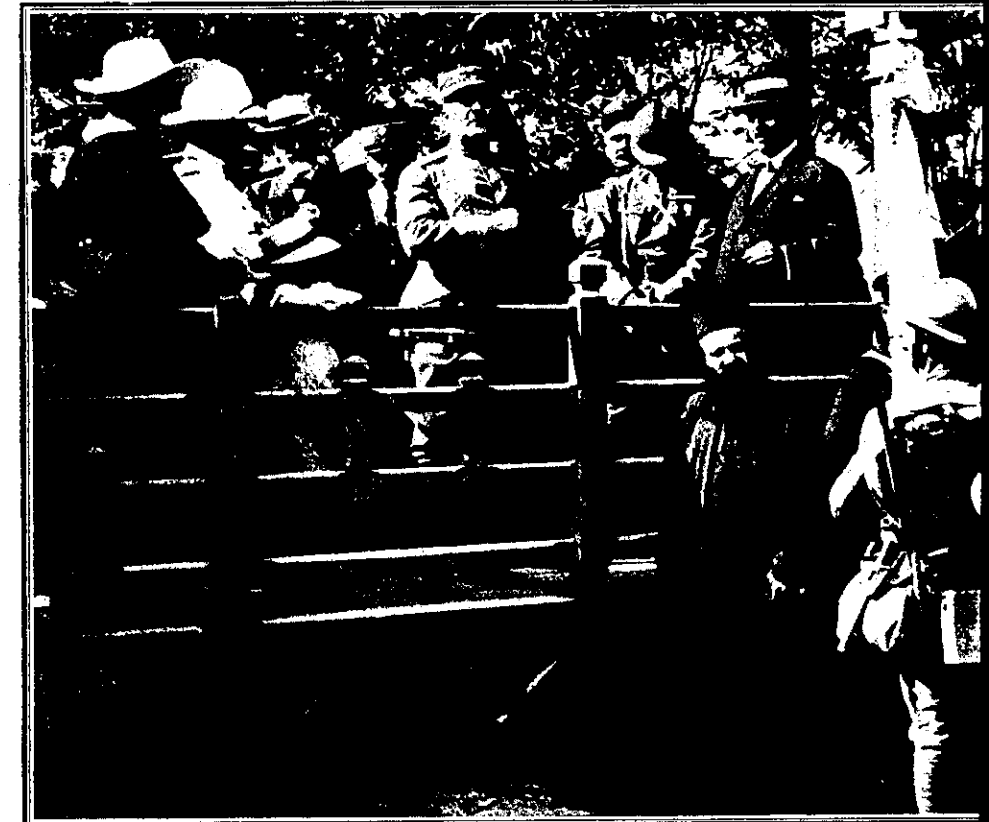
AFTER BLESSING THE FLAGS THE COLONEL OF A GREEK REGIMENT STANDS WITH HIS REGIMENT PRIOR TO THEIR DEPARTURE FOR MACEDONIA TO ASSIST THE ALLIES IN THE DEFEAT OF THE TURKS.