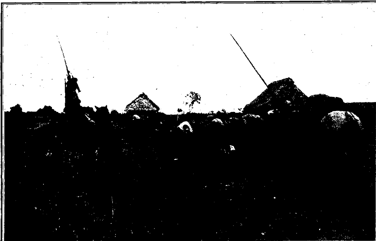
A SCENE ON THE RUSSIAN FRONT.—COSSACKS ENGAGED COLLECTING A FEW ODD PRISONERS. RUSSIA'S DEMORALISED CONDITION CONSTITUTES A CONSTANT ANXIETY TO THE ALLIES.