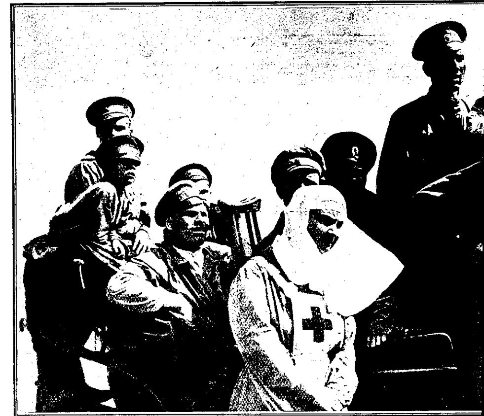
WOUNDED RUSSIANS AND THEIR NURSE WATCHING A RECENT REVIEW IN SKY, THE RUSSIAN WAR MINISTER, WHO HAS DONE HIS UTMOST TO ASSIST THE ALLIES IN THE DEFEAT OF RUSSIA—A DISHEARTENING TASK.