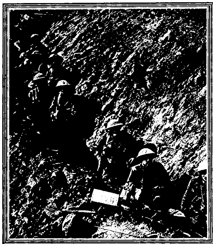
Infantrymen in the trenches awaiting the word to participate in a British advance. The men are ready with fixed bayonets to spring over the parapet at a given signal.