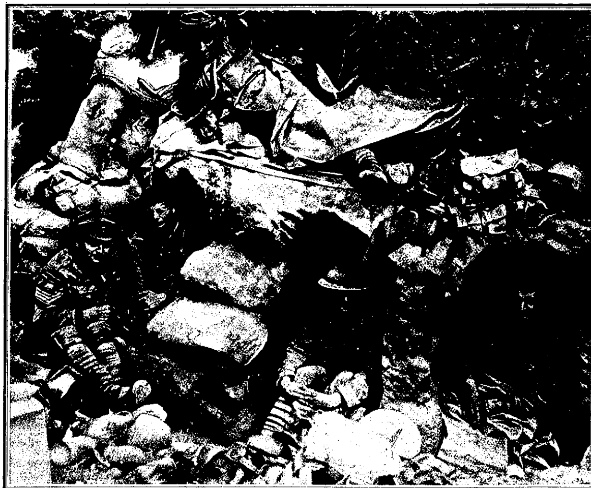
SHELTERED FROM THE RANGE OF THE GERMAN ARTILLERY.—Britishers resting in their quaint dug-outs during an enemy bombardment.