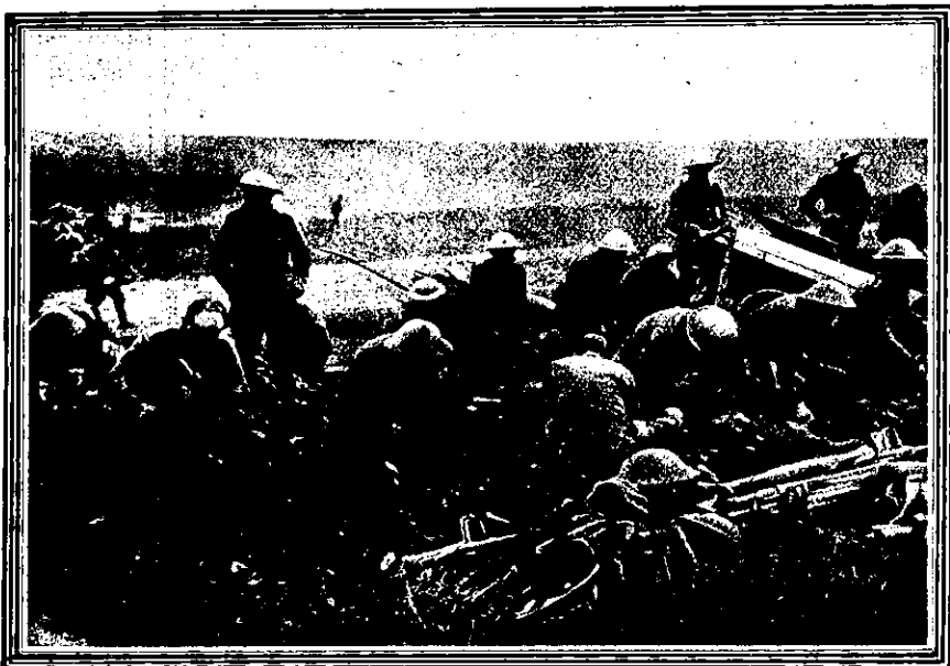
British soldiers preparing to dig themselves in during the advance on the Somme. The men have divested themselves of all their infantry equipment and are breaking the first soil at the point decided upon for excavations.