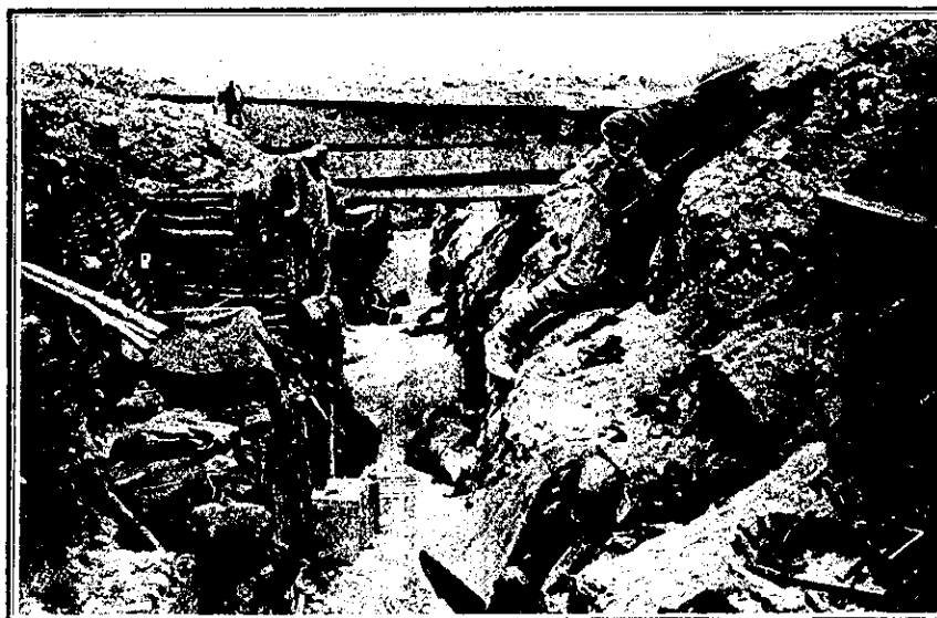
Soldiers resting in a British trench. While in slumber their comrade cautiously watches for any indication that may presage the approach of the enemy.